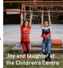
Joy and laughter at the Children’s Centre

The Open Doors Colombia team has recently relocated its office. Pray for the swift completion of the new office, and in particular for a good internet provider and service. Pray that these changes will not interfere with the work of serving the persecuted church.