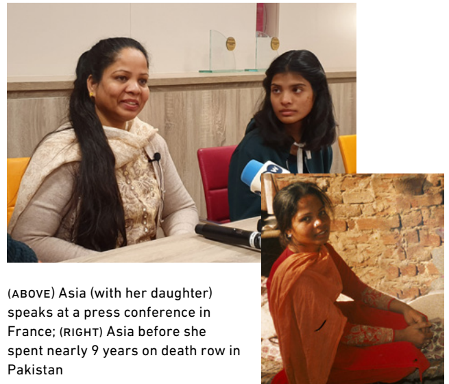
(ABOVE) Asia (with her daughter) speaks at a press conference in France; (RIGHT) Asia before she spent nearly 9 years on death row in Pakistan